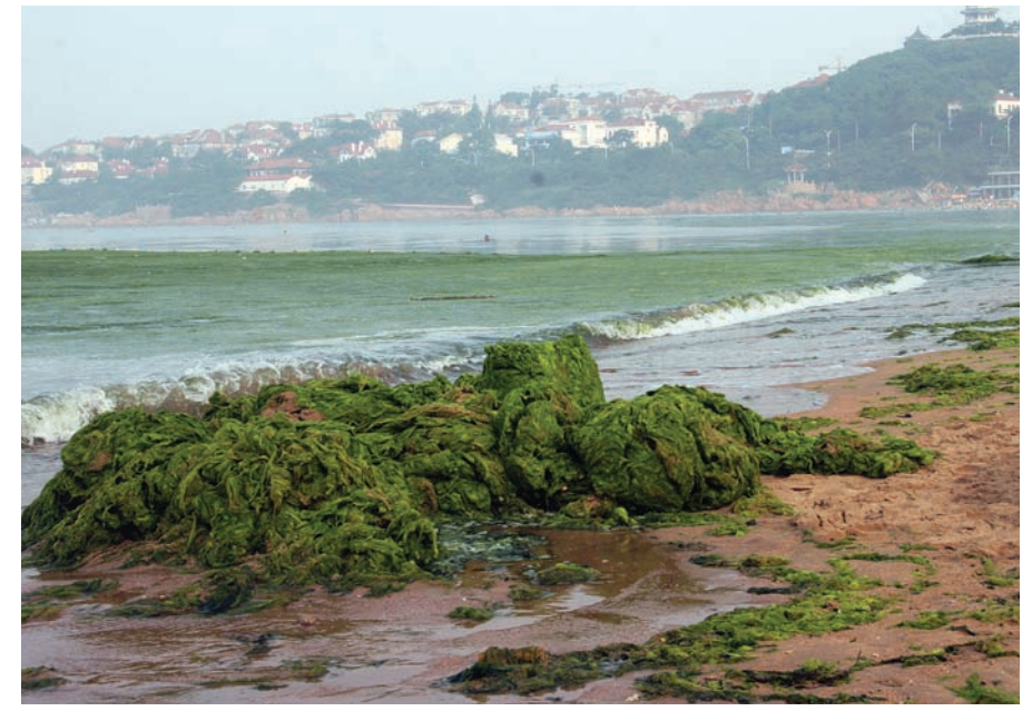
A "green tide" of Ulva prolifera seaweed just before the sailing events of the 2008 Olympic Games in Qingdao, China, triggered a massive clean-up.

unintentional consequence of coastal eutrophication. Obviously, it would be beneficial to reduce nutrient loading at the source, but this may not be possible in the present context of economic development along China's coastal zone.