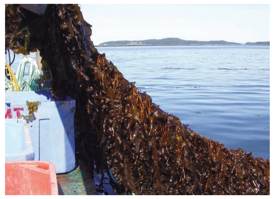
Kelps harvested at an IMTA site in the Bay of Fundy in New Brunswick, Canada, remove dissolved nutrients from the ecosystem while providing commercial products.